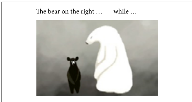
Figure 5. Activity using a grammatical frame to practice contrastive stress. Students were provided with the frame “the bear on the right ... while ...” and asked to compare the bears.

The frames were also used to bridge between sentence reading and free speech by pairing them with pictures, as in Figure 5. In these tasks, we showed the visual on PowerPoint along with the grammatical frame and asked students to compare the two bears. When a student compared the bears, we provided feedback on his or her performance and encouraged a correct form. We then asked another student to give us another sentence comparing the two bears, and so forth until several students had a chance to answer.