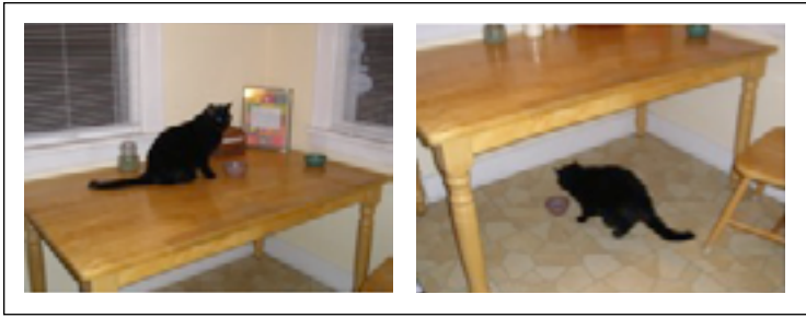
Figure 1. Two cats picture comparison.