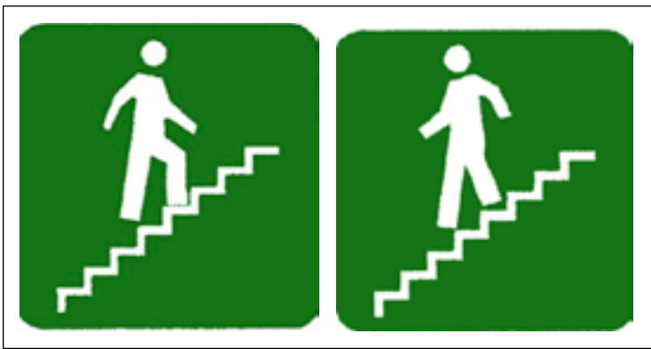
Figure 2. Upstairs and downstairs picture comparison.